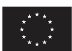
Funded by the European Union