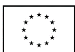
Funded by the European Union

Only two mandatory elements shall remain in each public document, information or publicity product or activity and in communication with the target group, the press or the public and in the labelling of equipment: a) the EU emblem; b) the phrase "Funded by the European Union". The Programme logo will no longer be used.