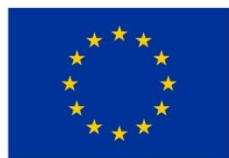
Picture 1: the European Union flag, Programme logo and inscription on EU funding

This programme is funded by the European Union